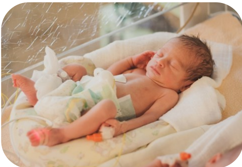
Nested with blanket rolls so my arms and legs are bent towards the middle of my body

I/We know how to roll our baby over so he/she doesn't startle _____ (initial/date)