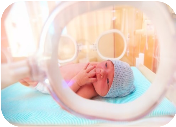
Sucking on hands with relaxed face