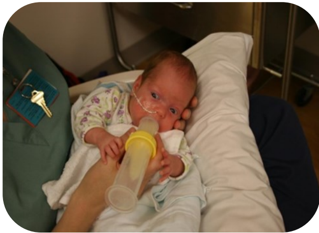
Eating on left side with pillow support