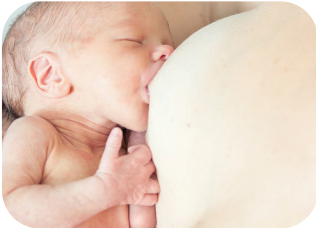
Learning to breastfeed may be something we can do when I get bigger