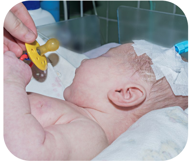
Offering me a pacifier helps me soothe myself