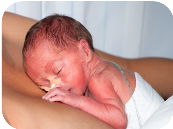
Skin to skin on Mom's chest

I/We know how to do Skin to Skin _____(initial/date)