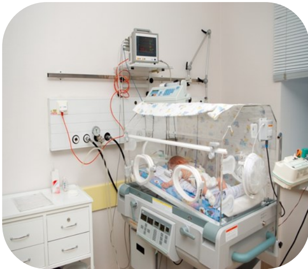
Covering my isolette with a blanket protects my eyes from bright light

I/We know how to manage the light around our baby's bedside _____ (initial/date)