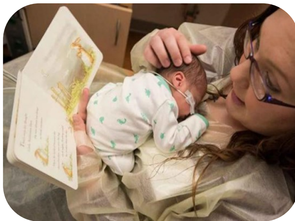
Reading me a story.