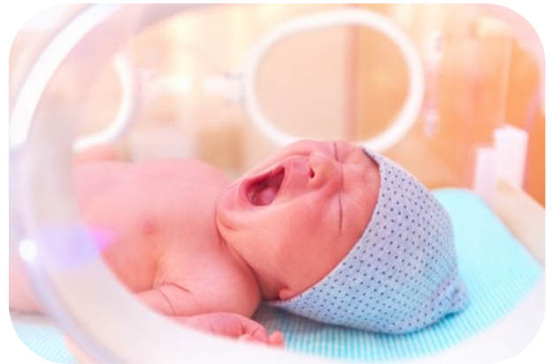
Frown with high pitch cry

I/We are able to recognize our baby's cues to understand how he/she feels _____(initial/date)