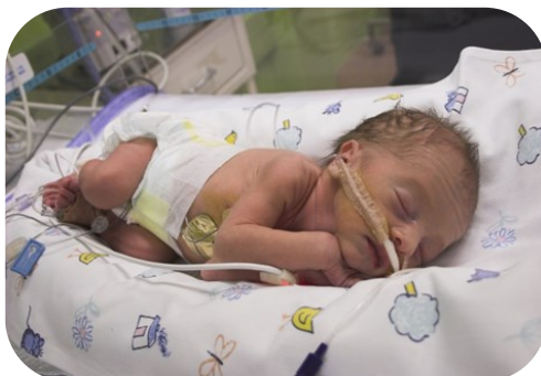
Arms and legs tucked towards the middle of my body with my hands on my chest