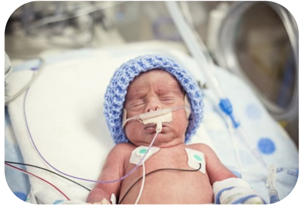
Frown with eyes and lips tightly closed