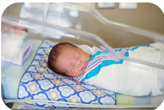
Swaddled, warm and cozy on my back