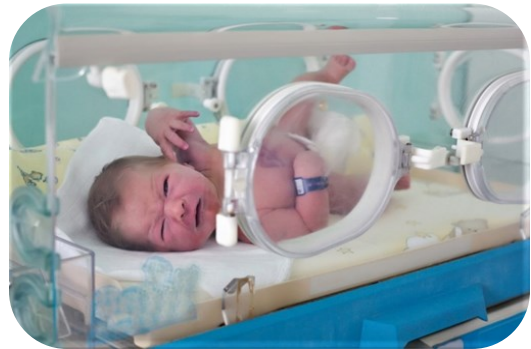
Frown, arching my head, with arm and leg moving away from body