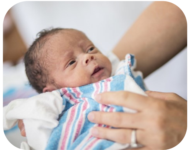
Holding me and talking to me softly while swaddled

I/We know how to calm our baby and help him/her relax _____(initial/date)