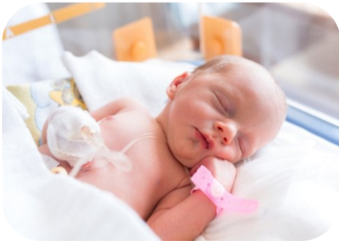
Relaxed face and mouth with hands towards face and tummy