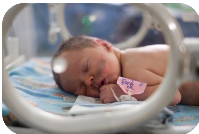
Sleeping on my tummy sometimes helps me rest more comfortably

While I am in the NICU on a monitor and under 24 hour medical care, I can sleep in different positions like on my side or on my tummy. But when I go home I should always sleep on my back. My NICU Team will explain why SAFE SLEEP is important for me.