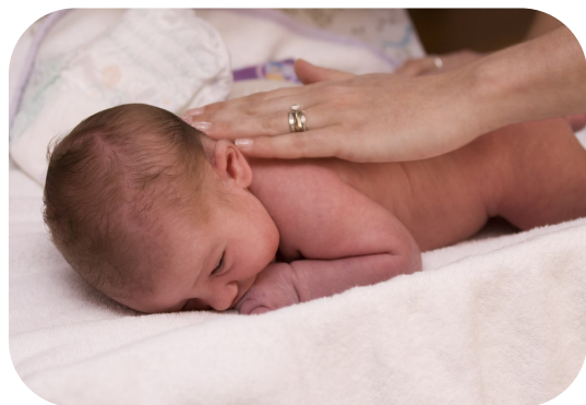
Learning how to massage me using gentle pressure on my back