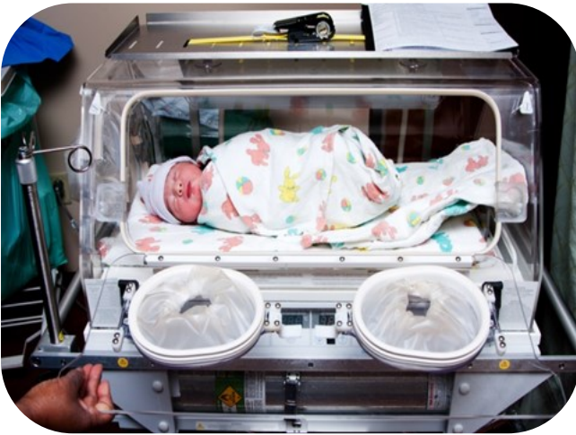
Sleeping swaddled on my side