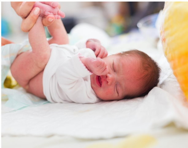
Changing my diaper