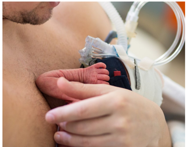
Comfort care is skin to skin time with my Dad