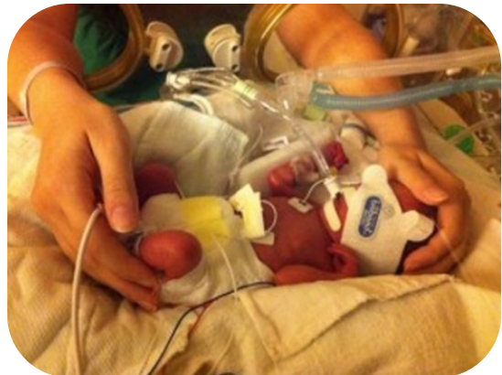
Gentle pressure on my head and bottom helps me feel contained and safe