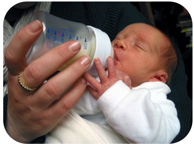
Holding my hands towards my chest helps me coordinate suck, swallow and breathing