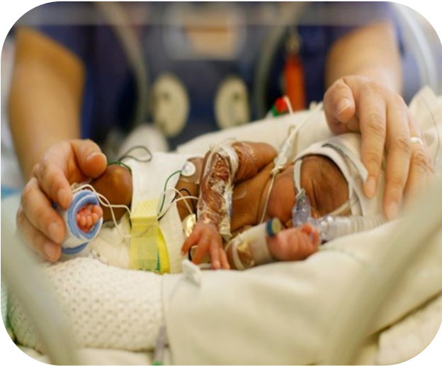
In a nest, on my side, with gentle hands to contain me