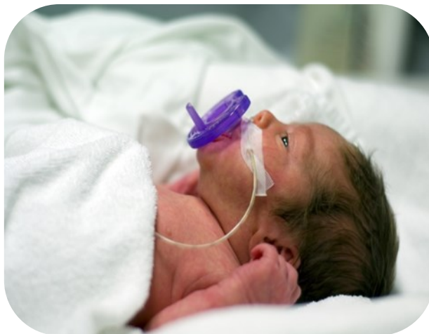
Pacifier sucking during a tube feeding

How do you know if I am hungry? When I am ready I will: