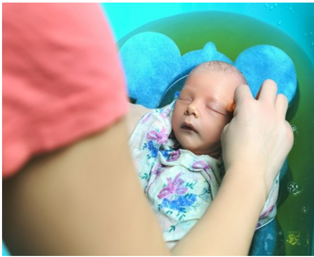
Swaddled bathing helps me stay warm