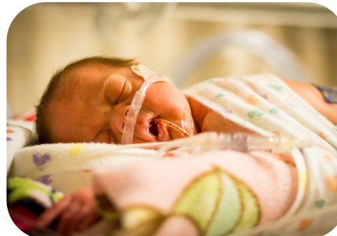
On my tummy in a swaddler helps me relax and sleep