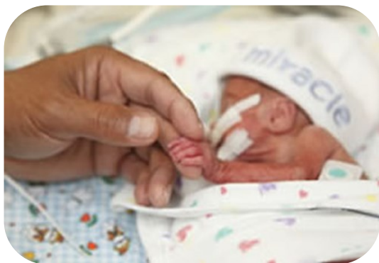
Holding my Mom's hand helps me feel connected to you