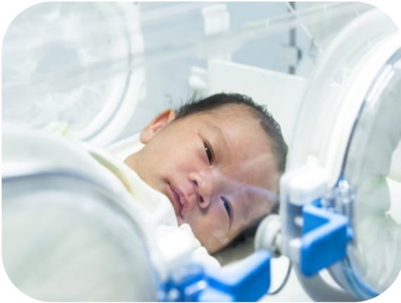
Quiet, alert face